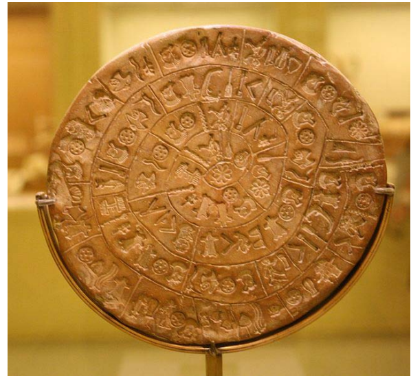
Figure 4: Phaistos Disk (clay tablet, side A, 2 nd mill. BC, Archaeological Museum of Heraklion). 44