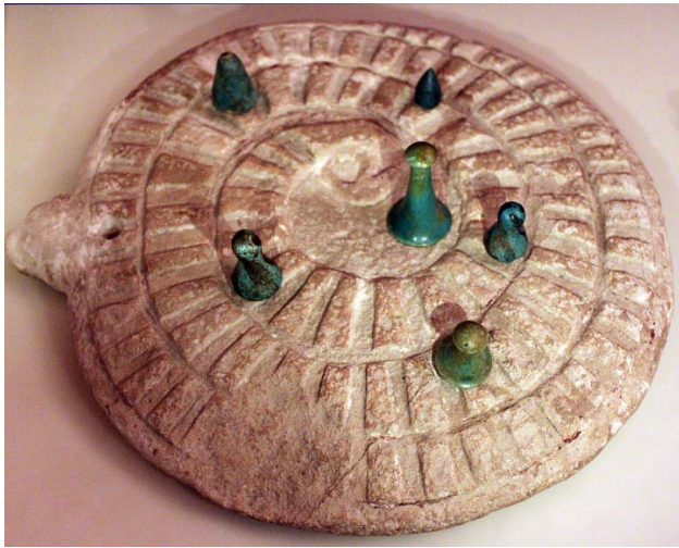
Figure 3: The Game of the Snake – Mehen (Limestone, early dynastic period, c. 3000 BC, Egyptian Museum of Berlin, Creative Commons). 41

The history of games has shown that ancient societies did not distinguish between activities linked to sacred and profane domains, 42 and that the first board games were used toward religious and divinatory ends. 43 The Myth of the Eternal Return as well as other works by Eliade such as The Sacred and the Profane leave no doubt as to the veracity of this hypothesis.