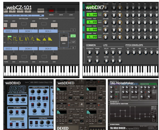
Figure 2: online WAM instruments

Another group has been developing Web Audio Modules (WAMs) since 2014 [3]. WAMs are high level audio plugins for the Web browser and have a C++ API, like native plugin formats. The WAM team ported to Web Audio famous commercial synthesizers such as the Yamaha DX7 or the Oberheim OBXd. See Figure 2.