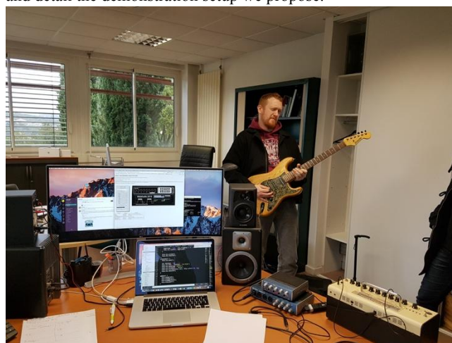
Figure 1: Typical demo setup: a guitar, a low latency sound card, speakers, and a Web browser with the apps running.

Finally, in section 4, we will conclude with some perspectives and detail the demonstration setup we propose.