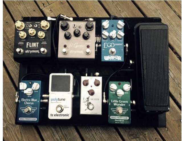
Figure 3: A real pedal board used by guitarists. Audio FX pedals are chained together before going to the amplifier.

sound file, the output is the speakers (Figures 3 and 4). In the WASABI pedal board, you can drag and drop effects, connect them, change the settings using knobs or sliders, control them using a MIDI control device (if your browser supports the WebMidi API), and you can also plug the tube guitar amp simulator presented in section 2 -we made it a plugin too. Each “pedal” or “amplifier” is a WebComponent, and implements our draft version of a “WebAudio” plugin API 6 .