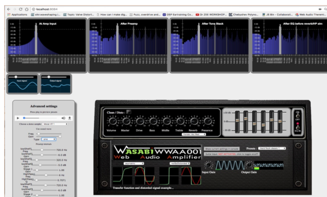
Figure 2: Full GUI of the tube amp guitar emulation, with debug tools displayed (freq. analyzers, advances settings etc.).

the electronic schematic with tools like the industry standard SPICE analog circuit simulator to translate the circuit into equations to be solved. These general equations are typically nonlinear differential algebraic equations that may be solved using integration methods, roots solver algorithms, and sparse matrix techniques. SPICE can produce C++ code ready to be executed. However, it is often necessary to make simplifications and optimizations to achieve solutions suited for real-time processing. This is critical for the modeling of the vacuum tubes used in guitar amplifiers with their typical interactions with other parts of the circuitry (see [1] for a review of common techniques). Also, the physical approach usually assumes perfect behavior of the electronic components used (resistors, capacitors, tubes, etc.) making it difficult to render the typical empirical design / fine tuning, ala "musical instrument making", of the tube-based guitar amps in which much of the coloring of the sound comes indeed from the limitations and non-linearities of the electronic components used.