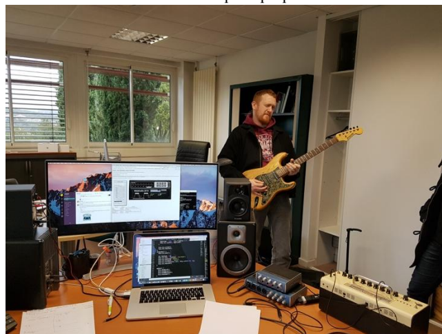
Figure 1: Typical demo setup: a guitar, a low latency sound card, speakers, and a Web browser with the apps running.

Finally, in section 4, we will conclude with some perspectives and detail the demonstration setup we propose.