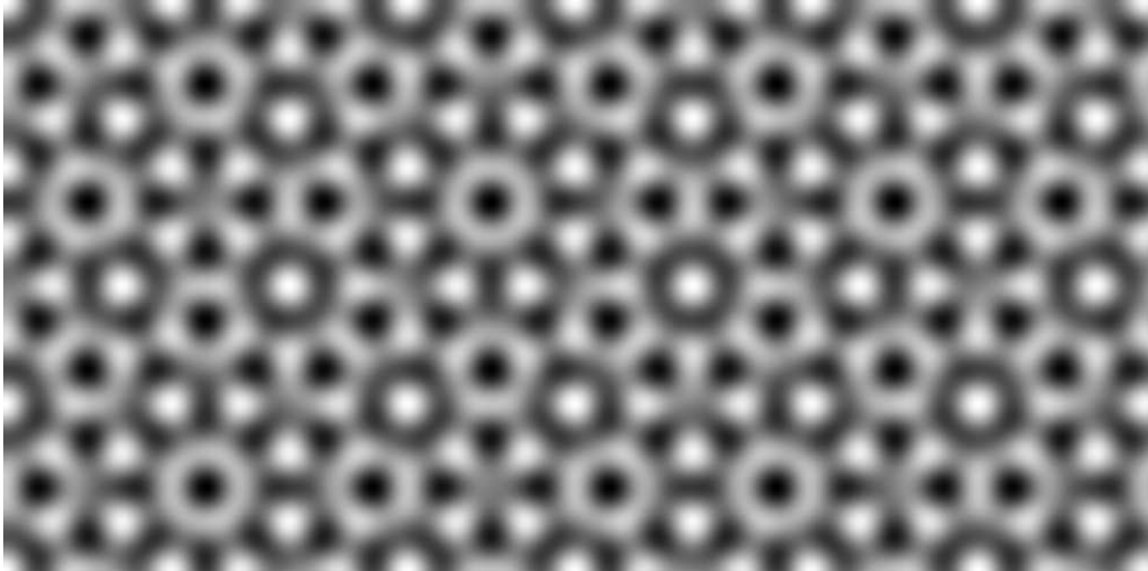
Figure 1: Example 8-fold quasipattern after [IR10]. This is an approximate solution of the steady Swift–Hohenberg equation (2) with \lambda = 0.1 , computed by using Newton iteration to find an equilibrium solution truncated to wavenumbers satisfying |\mathbf{k}| \leq \sqrt{5} and to the quasilattice \Gamma_{27} obtained with N_{\mathbf{k}} \leq 27 .

fact that for the linearized operator at the origin (here -(1 + \Delta)^2 ), the 0 eigenvalue is not isolated in the spectrum, appearing as part of the continuous spectrum.